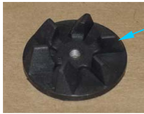
CLUTCH, RUBBER 990034700